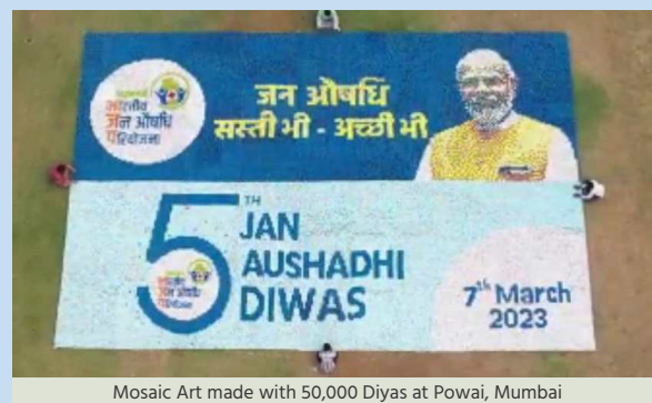
Mosaic Art made with 50,000 Diyas at Powai, Mumbai

7th March is celebrated as Jan Aushadhi Diwas every year to mark a tribute to Prime Minister Narendra Modi's Vision of "Healthcare to all". It is celebrated as a day of promise to use quality generic medicines at affordable prices. This year's theme remained "Jan Aushadhi-Sasti Bhi, Acchi Bhi" . In this view, to solicit participation from States / UT's, all the State Governments were requested to organize State level events to spread the messages of generic medicines and Jan Aushadhi Pariyojana. All the Hon'ble Union Ministers were also requested to visit and attend events at various Jan Aushadhi Kendras in their constituencies so that the benefits of Scheme can be conveyed by Public Representatives.